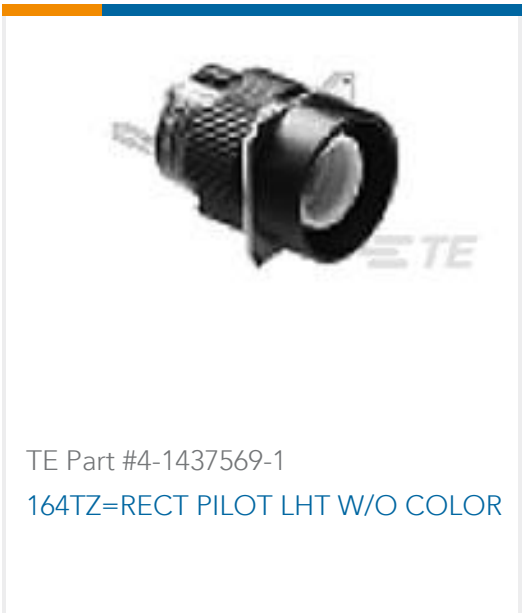
TE Part #4-1437569-1 164TZ=RECT PILOT LHT W/O COLOR