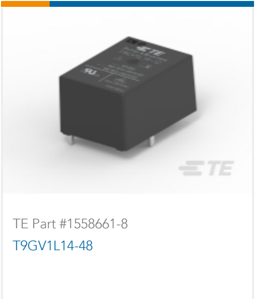
TE Part #1558661-8 T9GV1L14-48