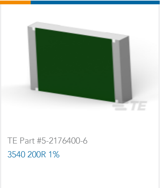
TE Part #5-2176400-6 3540 200R 1%