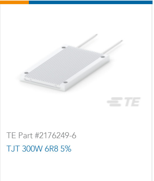
TE Part #2176249-6 TJT 300W 6R8 5%