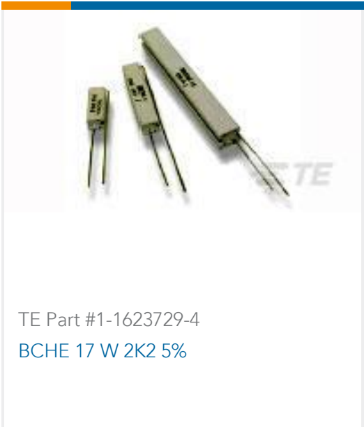
TE Part #1-1623729-4 BCHE 17 W 2K2 5%