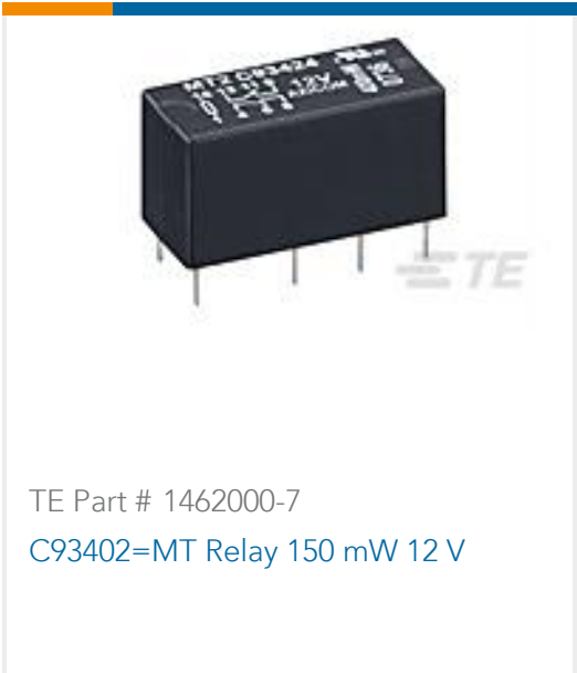
TE Part # 1462000-7 C93402=MT Relay 150 mW 12 V